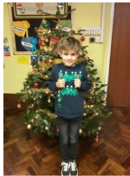
Lower School Winner!