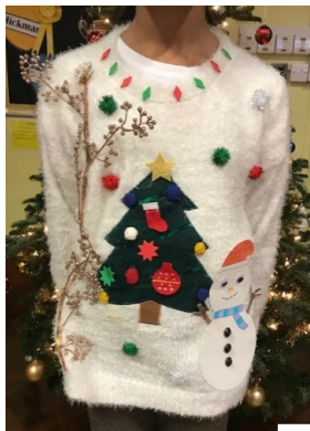
Upper School Winner!