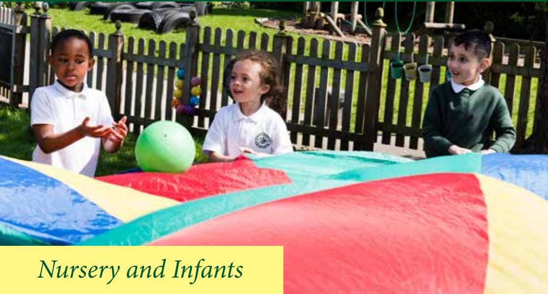
Nursery and Infants