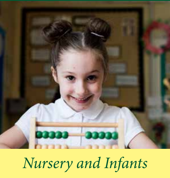
Nursery and Infants