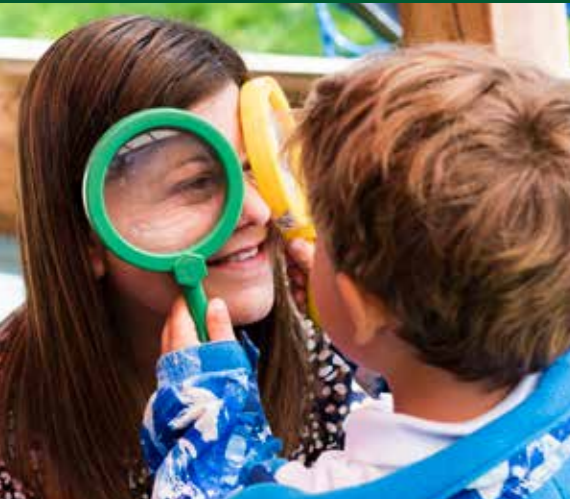
Nursery and Infants